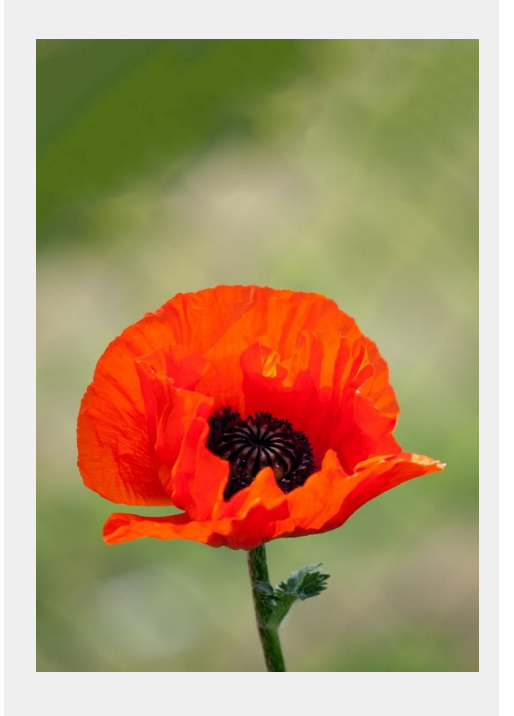
The 11th Day of the 11th Month 1918

Next month will be the commemoration of the ending of the First World War 100 years ago. Most have heard of the Commonwealth War Graves Commission (CWGC) which honours the 1.7 million men and women of the Commonwealth forces who died in the First and Second World Wars. The Commission builds and maintains cemeteries and memorials at 23,000 locations in more than 150 countries and territories. In Cyprus, there are eight cemeteries and two memorials maintained by the CWGC with Waynes Keep being the largest and the resting place of 590 casualties.